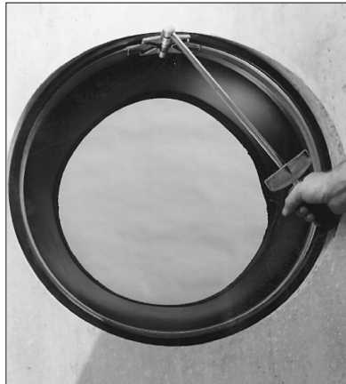
Install Kor-N-Seal® II - Wedge Korbond With Standard Torque Wrench