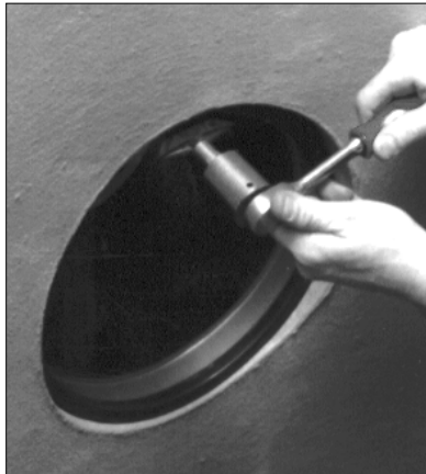
Install Kor-N-Seal® I - Wedge Korbond With Socket Wrench & Torque Limiter