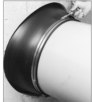
Install Pipe Clamp(s) With T-Handle Torque Wrench